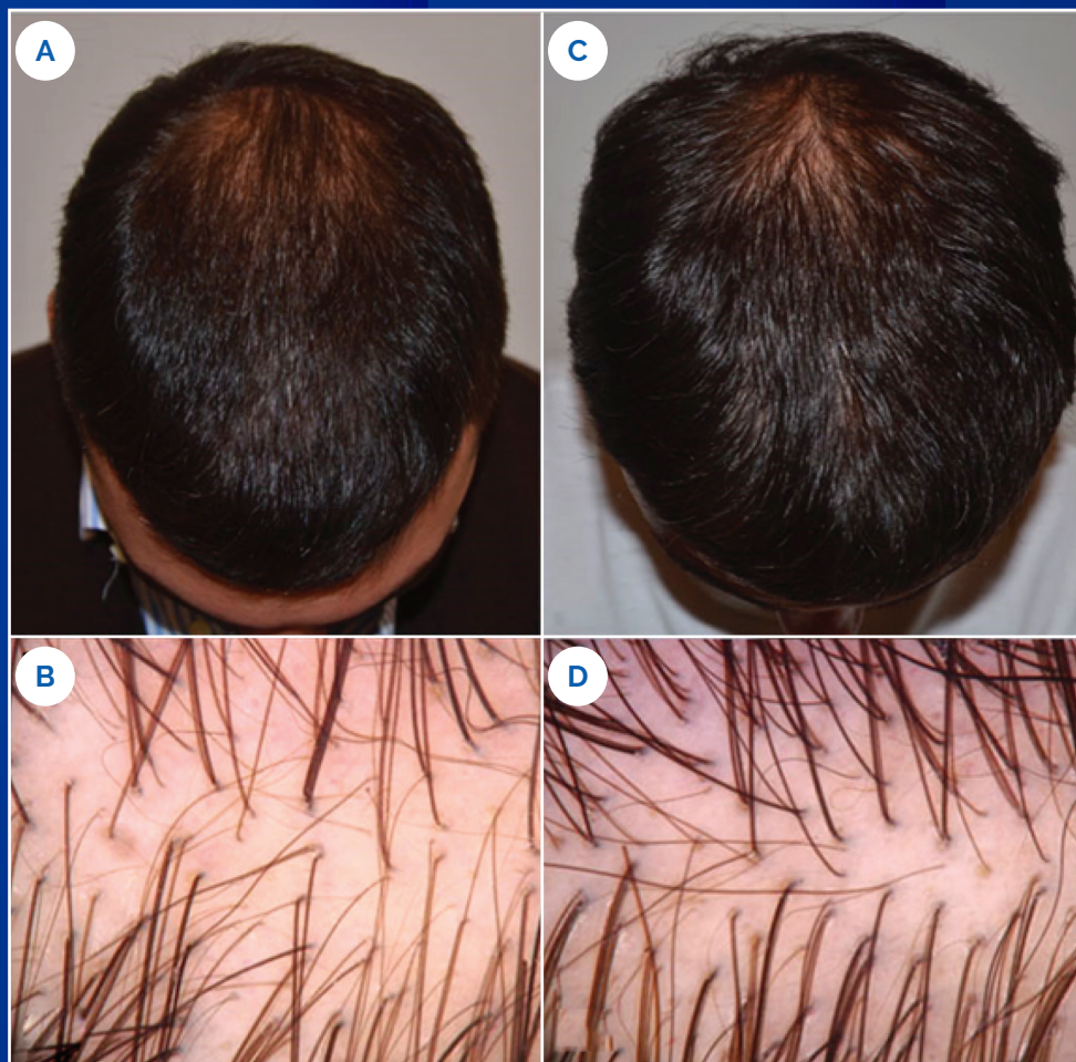
Figure 1. Androgenetic alopecia in a 31-y-old male. Clinical picture (A) and corresponding dermoscopic image (B) at baseline and clinical picture (C) and corresponding trichoscopic image (D) with increased hair density after 6 months.